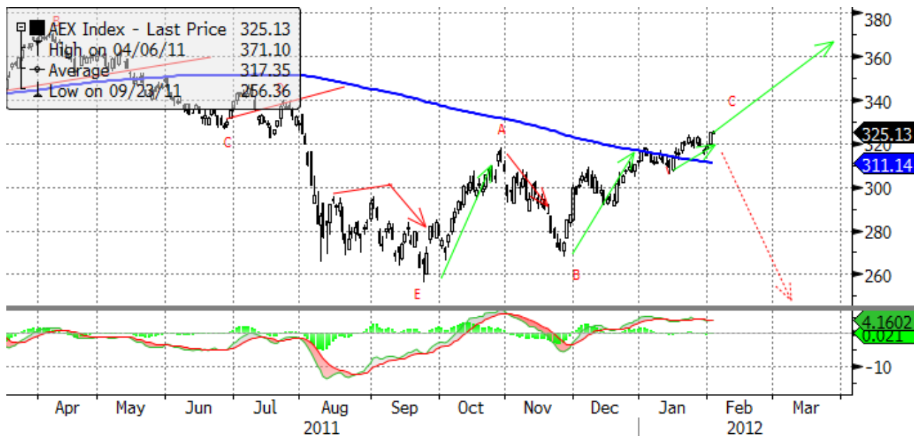
AEX Index (AEX-Index) 0Daily 25JAN2011-2FEB2012 Copyright© 2012 Bloomberg Finance L.P. 02-Feb-2012 12:17:21