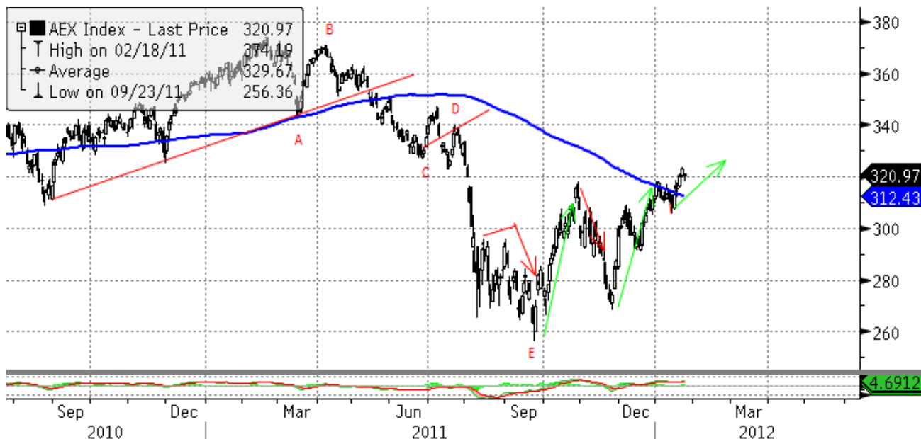
AEX Index (AEX-Index) 0Daily 17DEC2006-25JAN2012 25-Jan-2012 12:01:29