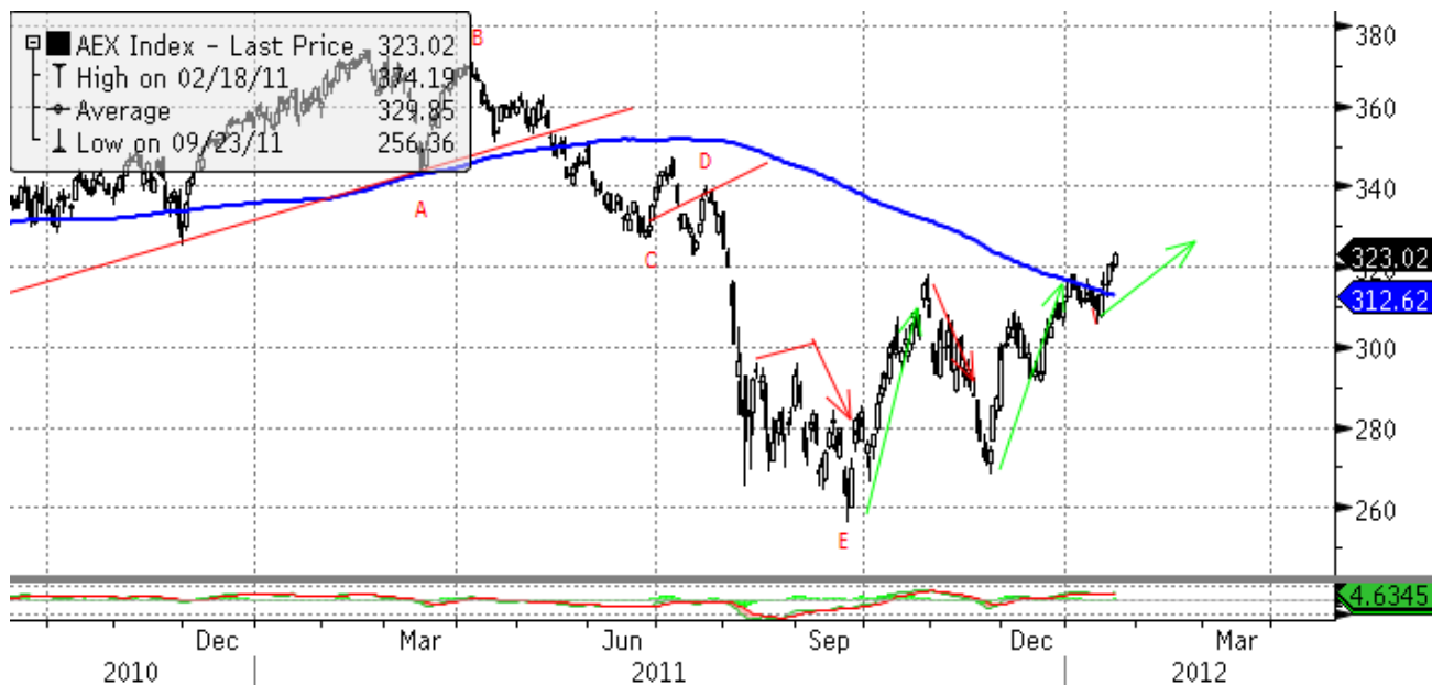
AEX Index (AEX-Index) 0Daily 17DEC2006-24JAN2012 Copyright© 2012 Bloomberg Finance L.P. 24-Jan-2012 11:17:20