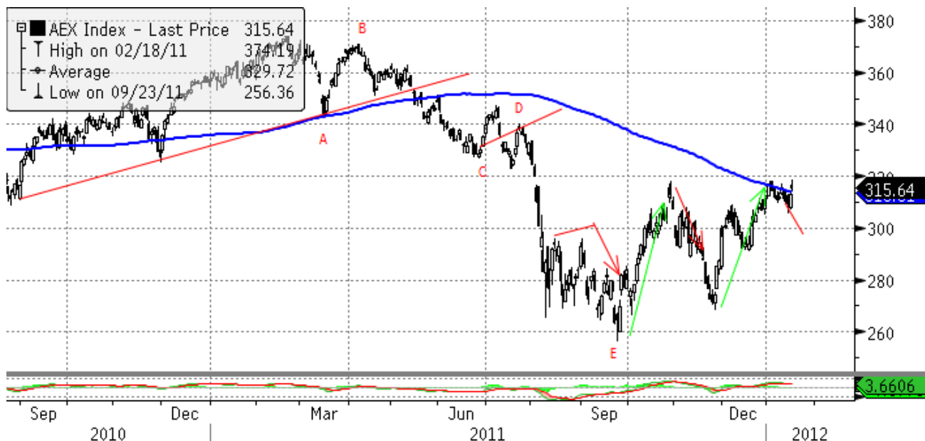
AEX Index (AEX-Index) 0Daily 17DEC2006-18JAN2012 Copyright© 2012 Bloomberg Finance L.P. 18-Jan-2012 11:39:34