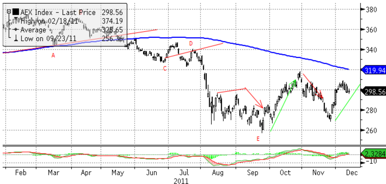
AEX Index (AEX-Index) 0Daily 28OCT2006-14DEC2011 Copyright© 2011 Bloomberg Finance L.P. 14-Dec-2011 11:30:29